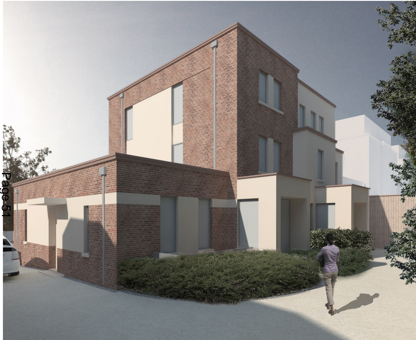
View of entrance from driveway.