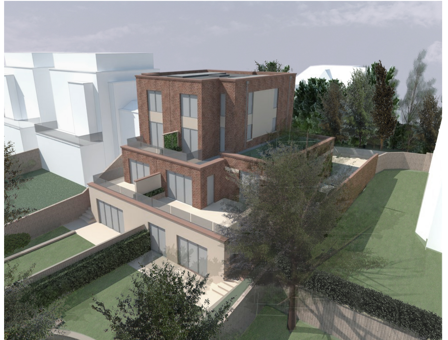
Aerial view from South East.

REV P2 - 24/02/16 - Render treatment on east elevation. Reduced height of single storey east wing by 0.4m REV P1 - 07/12/15 - Issued for planning Revisions